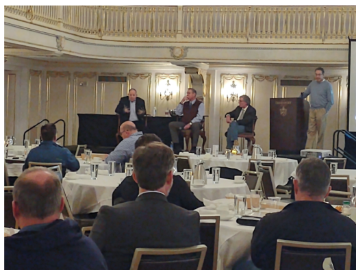
WACA 2021 Winter Workshop

PAC contributions create awareness of our industry and the issues important to your business. PAC contributions support local county, district, and statewide legislative candidates, statewide Initiatives, or independent campaigns that require Association engagement to advance, support, or oppose statewide issues independently or as part of a broader industry or business coalition.